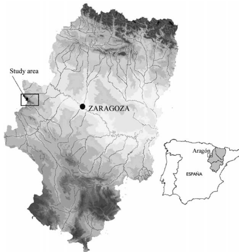
Figure 1. Site of the study area

The amount of water that reaches the soil in a forest depends on the effect that some climatic factors, such as wind, insolation and other bio-geographic factors that are linked to the forest structure itself, exert on the rainfall. These factors are also related to its density, stratification and to the physiognomic characteristics of the dominant species. Both factor groups control some mechanisms such as interception, stemflow and rain through-fall through the leaf cover. Furthermore, when water reaches the soil surface its infiltration is conditioned by the soil physico-chemical characteristics, fundamentally by the presence of leaves duff, the texture, structure and amount of organic matter.