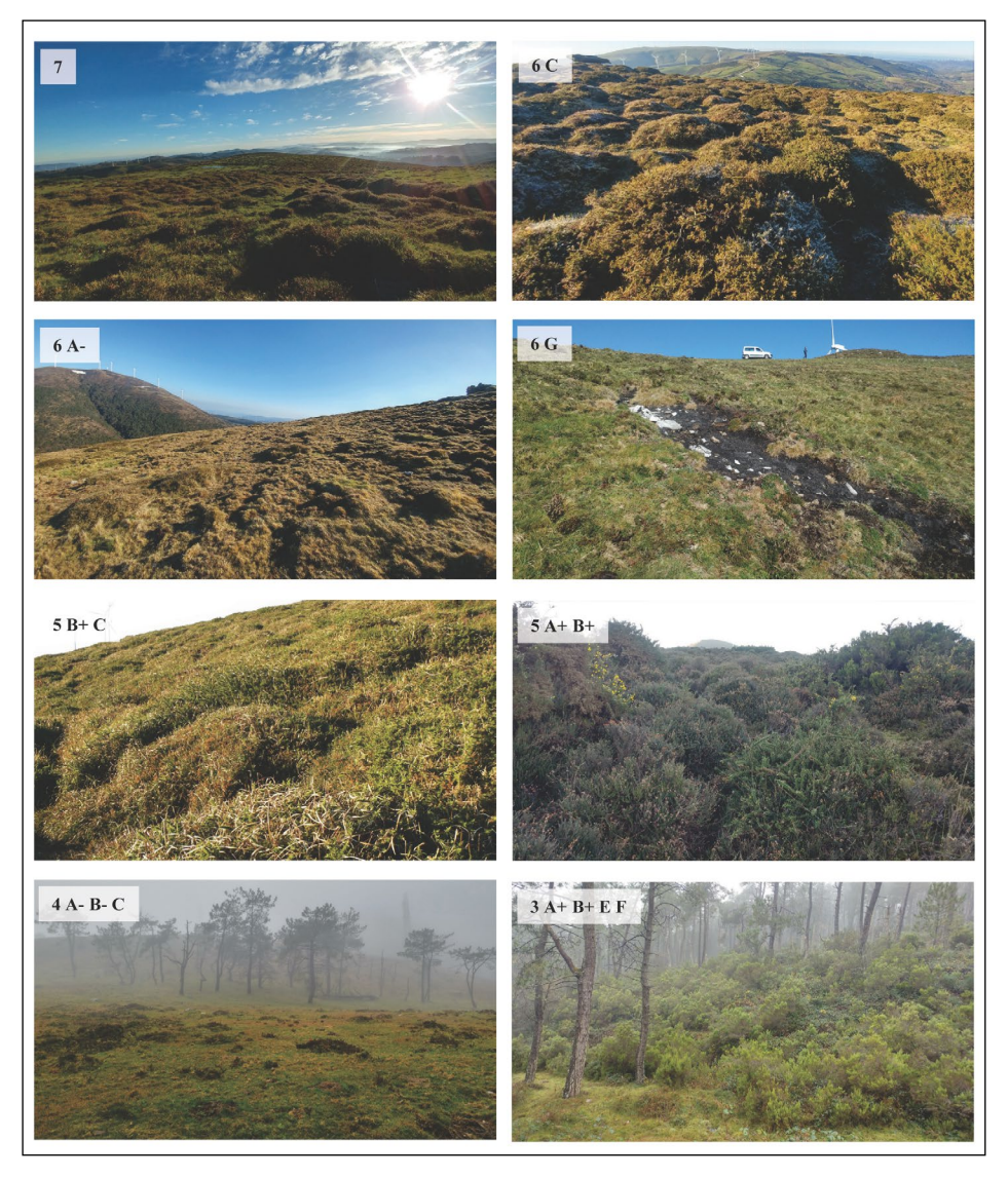
Figure 3. Examples of heath stands with different HQA scores. (7) optimum state; (6 C) very good habitat quality with high gorse cover; (6A-) very good habitat quality with shrub height < 0.3 m; (6 G) very good habitat quality with recognized erosive events; (5B+C) good habitat quality with high shrub-grass ratio and gorse cover; (5A+B+) good habitat quality with high canopy and shrub-grass ratio; (4 A-B-C) medium habitat quality which fails due to vegetation structure, shrub-grass ratio and gorse cover; (3A+B+E F) medium habitat quality which fails due to vegetation structure, shrub-grass ratio, natural succession showing high cover of shrub and presence of pines.