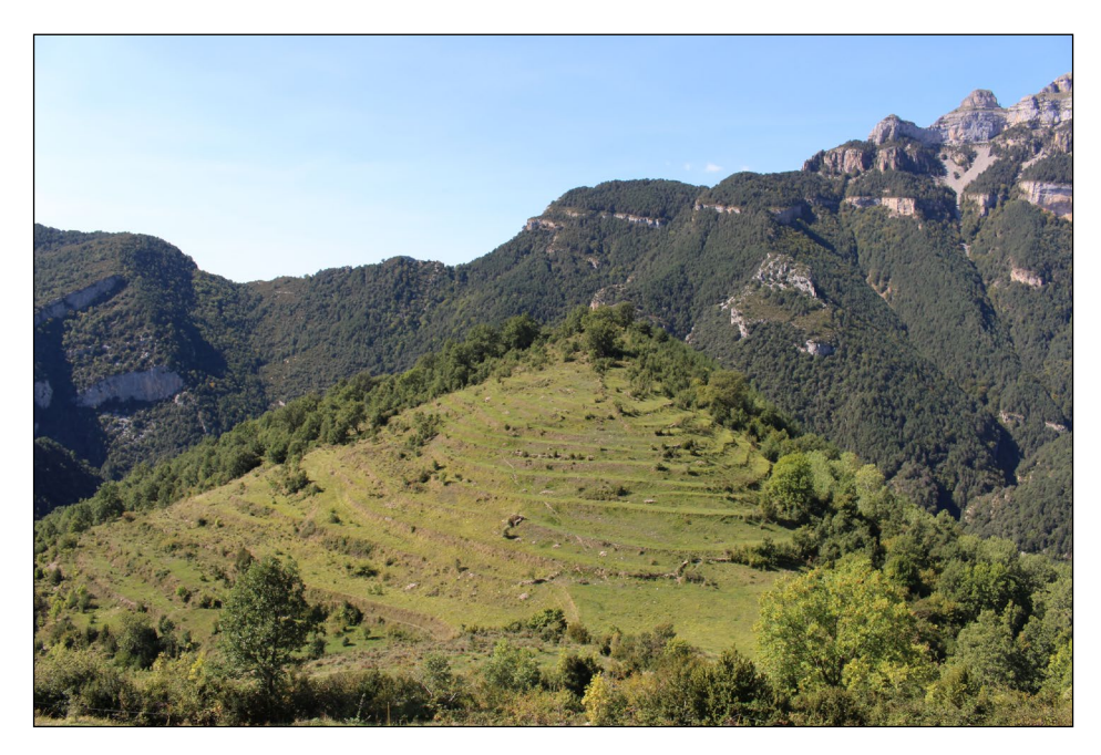
Figure 4. Terraces around Bestué (Pyrenees, Spain). Terraced slopes were built to cultivate steep slopes in mountain areas, creating complex anthropogenic landscapes. Nowadays, most of the terraced systems are abandoned and revegetation processes occur.

landscapes is the creation of agricultural terraces (Tarolli et al. , 2014, 2018). Terracing of hillslopes and mountain sides for agricultural use is certainly one of the largest anthropogenic geomorphic processes in many mountain worldwide areas (Arnáez et al. , 2017; Camera et al. , 2018; Calsamiglia et al. , 2018) (Fig. 4). Tarolli (2016) highlighted other examples as urban development, urban growth, embankments for railways, roads, canals, irrigation networks, open mining or below ground mining, land levelling and soil quarrying. In that sense, the paper written by Raczkowska (2019-in this issue) presents a good example of human impacts in the Tatra Mountains including mining and metallurgy, wood exploitation and oil extraction, as well as tourism activities.