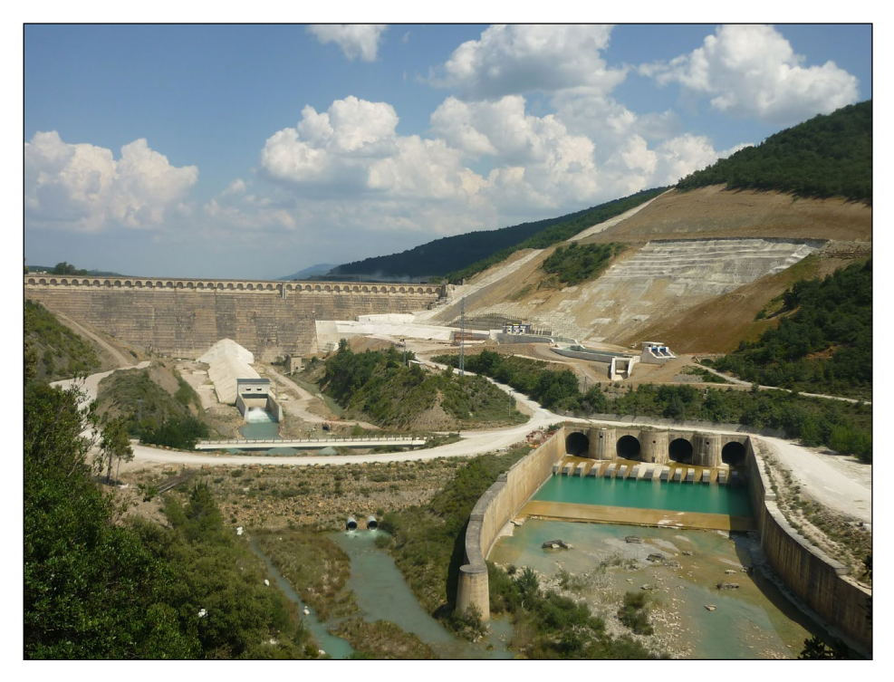
Figure 2. Dam construction in the Central Pyrenees (Yesa reservoir). Dams and reservoirs have been constructed worldwide modifying the hydrological dynamics and transforming the stream network.