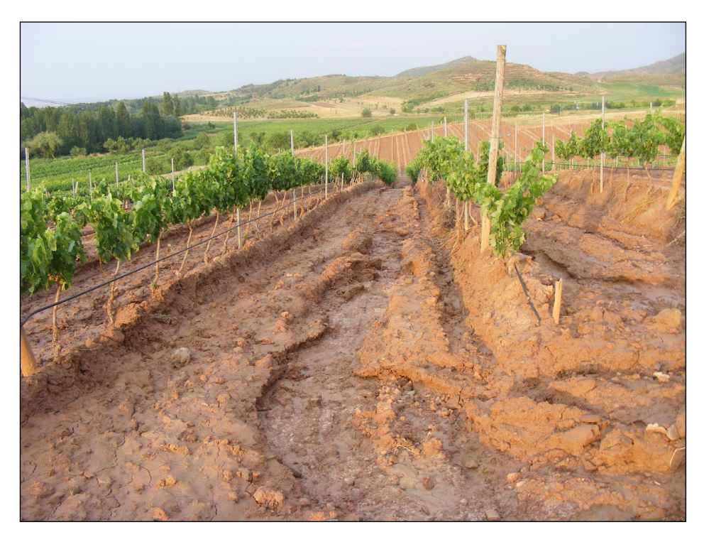
Figure 3. Soil erosion in young vineyard fields in La Rioja (Spain). Agricultural activities modified the soil and intensified soil erosion processes. Many authors suggest that soil erosion in vineyards are the highest soil erosion rates worldwide.

carbon reservoir stored in the fluvial sediments and soils in the catchment. Many studies have also suggested that major land use changes in the Anthropocene has increased soil erosion rates worldwide (i.e. García-Ruiz et al. , 2017) and that agricultural activities show the highest erosion rates (Montgomery, 2007) (see Fig. 3). In that sense, Pijl et al. (2019-in this issue) indicated that vineyard terraces showed the highest erosion rates of all Mediterranean landscape types. Their study demonstrated that vineyard mechanization shows higher erosion rates than non-mechanization fields, concluding that anthropic mechanization and related compaction and transformation of agricultural landscape (terraces and infrastructures) increase soil loss risk in an already erosion prone landscape type. Finally, Poesen published in 2017 the review paper titled " Soil erosion in the Anthropocene: Research needs " concluding that soil erosion in the Anthropocene mainly occurs as a consequence of a combination of natural and human-induced soil erosion processes, although an increasing number of studies indicates that anthropogenic soil erosion processes have become dominant.