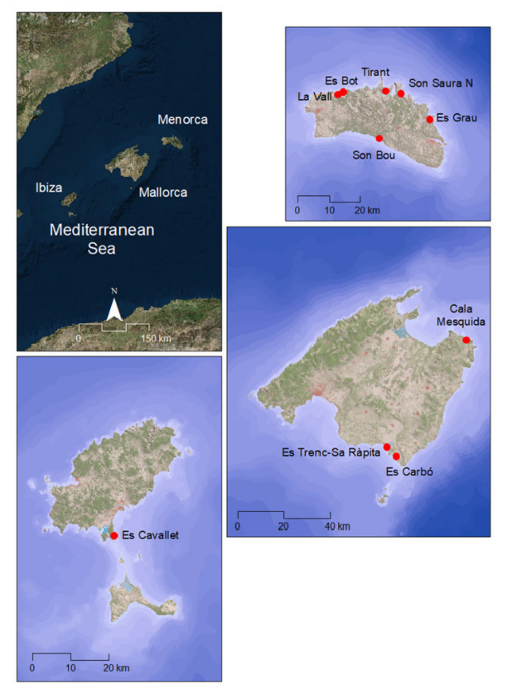
Figure 2. Location of the analyzed beach-dune systems.