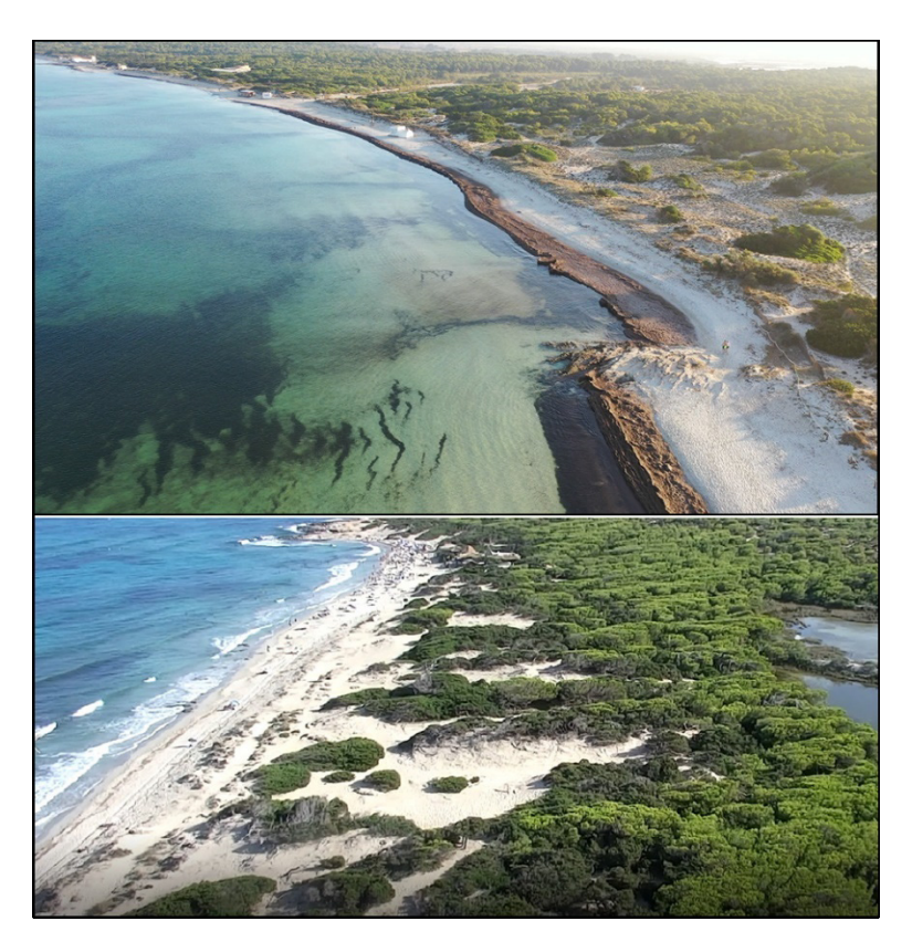
Figure 3. Dune systems of A.- es Trenc, Mallorca, and B.- Es Cavallet, Ibiza. Both systems located in natural parks.

Different management techniques have been applied in several dune systems of the Balearic Islands (Figures 3 and 4). The main ones are described below.