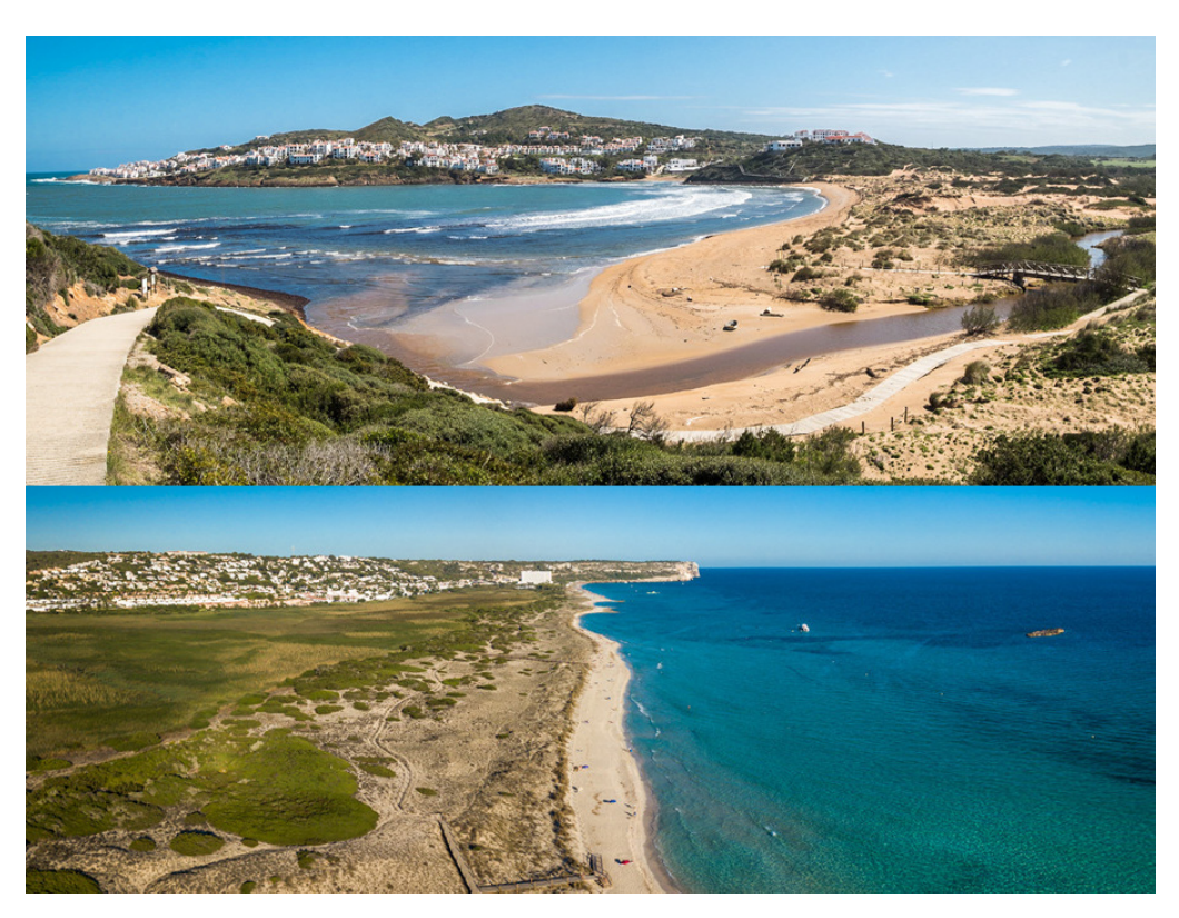
Figure 4. Dune system of A.- Tirant, Menorca, and B.- Son Bou Menorca. Both systems are located in natural areas of special interest.