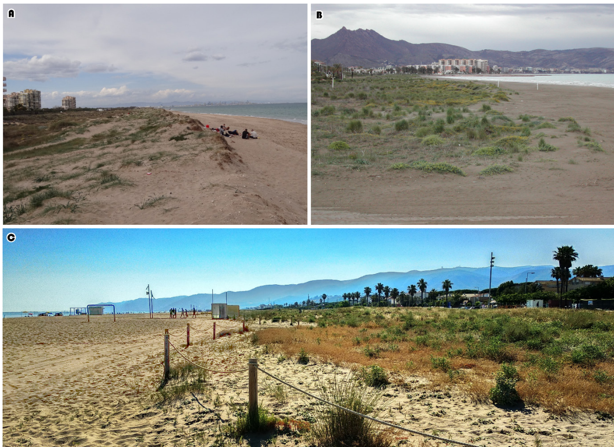
Figure 3. El Saler beach (A) in summer 2021, el Pinar beach in winter 2019 (B) and Castelldefels beach (C) in spring of 2019.

The coastal dunes of the Llobregat delta presented sand erosion, instability of the coast of Viladecans and the N of Gavà, sedimentation in the S Gavà and Castelldefels, the construction of Port Ginesta (1985), vulnerability, loss of surface of dune landforms, high frequentation, soil contamination and proliferation of invasive vegetation (Masip et al. , 2009). From the 90s onward, cords of sand were artificially piled up, simulating dunes that were later revegetated (Fig. 4). Later, under the Dunas Híbridas project (2014 to 2017 according to Palacios, 2017), new dunes were mechanically performed again and reprofiled some others. Afterwards, Ammophila arenaria was used to revegetate dune systems by fences, while invasive vegetation was removed. It is worth highlighting that many individuals of Ammophila arenaria from the Dunas Híbridas project died because of the lack of sand movement on the dune ridges. The artificial sand mounds present a granulometric stratigraphy with different grain sizes throughout the vertical segment. However, the dunes of aeolian origin present an ordered stratigraphic segment, with the coarsest and most compacted grains in the lower part and the finer and looser sand in the upper part. This natural arrangement favors the movement of sand grains located in the upper part of the dunes when soft winds blow. The lack of wind dynamics in artificial dunes favors compaction that, over time, ends up being a sandy plot rather than a dynamic dune area.