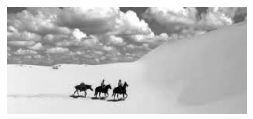
Figure 3. "Doomed landscapes".