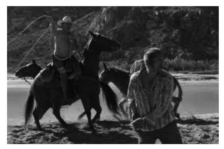
Figure 11. Becoming an undocumented, forced migrant in Mexico.

note, since it would have meant correcting the asymmetries and solving the conflicts that have troubled the region for almost two centuries now. Lorey (1999) and Martínez (2006) conclude their explorations of the borderlands by saying that, although some advances have taken place –mainly thanks to the efforts made by the inhabitants of the region–, there are still serious obstacles (isolation, political and economic interests, etc.) that complicate "the resolution of problems stemming from domestic trends and bilateral relations" (Lorey 1999: 178). Jones' film attempts to recapitulate a number of those obstacles and reflects on the changes that would need to take place in people's mentality in order to be able to overcome, at least, some of them.