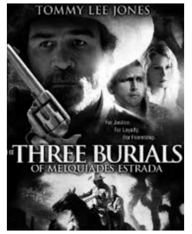
Figure 1. Film Poster of The Three Burials of Melquiades Estrada (2005).

Indeed, having been born and raised on the Texas-Mexico border, the director is not unfamiliar with the kinds of phenomena taking place in border regions, which combine a shared history and intense socio-cultural blending with signs of reluctance on both sides to fully embrace or reject the other culture. Lowenthal remarked over two decades ago that three traits define the bilateral relationship between the two countries in the area: "proximity, interpenetration, and asymmetry" (1987: 77), and although those characteristics may have evolved over time, they remain integral components of the border culture. Jones' prize-winning movie can be said to incorporate some of those key traits defining