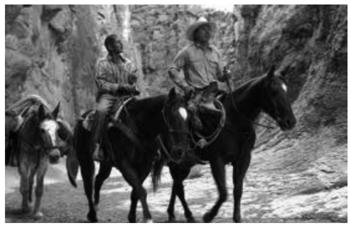
Figure 2. A different type of Western?

Being a resident of the Texas-Mexico border, Jones is of course aware of the profound transformation undergone by the borderlands –or what Anzaldua also called "la Frontera" (1987)– in the last two decades, and of the intense debates that have arisen after border controls and the construction of the wall were intensified