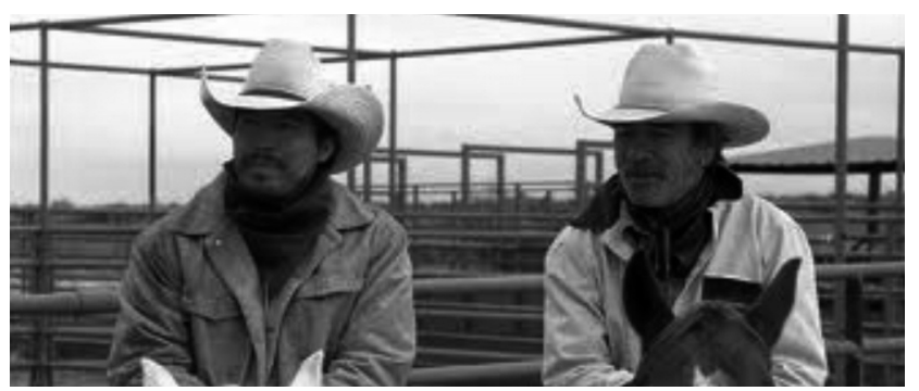
Figure 13. Strong human ties, despite difference and boundaries.