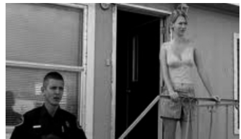
Figure 8. Feeling out of place.

Nevertheless, it would be incorrect to assume that nothing beautiful and edifying could grow in this rather barren setting. Lorey, for instance, concludes his compact study of phenomena in the area by saying that "despite lingering asymmetries and conflicts over land, water, migration, the environment, and other issues, the society of the border has been remarkable in its adaptation to rapid change and in its